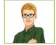
mon demi-frère my half/step brother