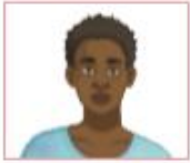
ma mère my mum