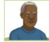
mon grand-père my grandfather