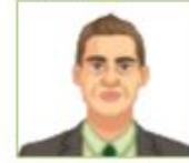
mon beau-père my step-father