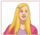
ma demi-soeur my half/step-sister