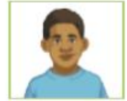
mon frère my brother