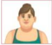
ma tante my aunt