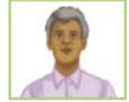
mon oncle my uncle