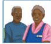
mes grands-parents my grandparents