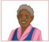
ma grand-mère my grandmother