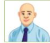
mon père my dad