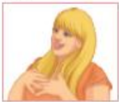
ma belle-mère my step-mother