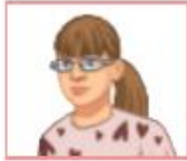
ma cousine my cousin (f)