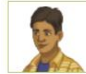
mon cousin my cousin (m)

Using this word mat can you create your own family tree or a made-up family tree? This time we are using ma, mon and mes for 'my'.