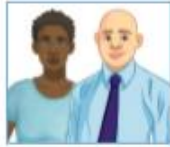
mes parents my parents