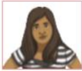
ma soeur my sister